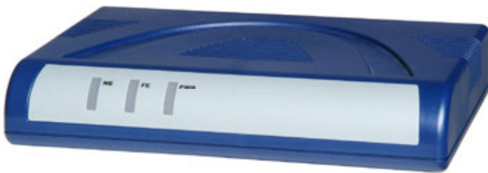
S-RPT with Plastic Enclosure