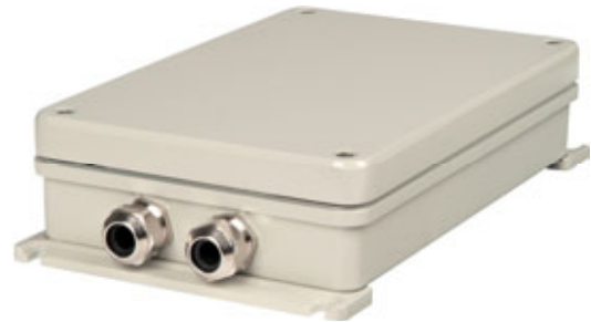
S-RPT with IP-67 Metal Enclosure